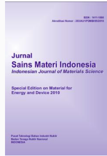
INDONESIAN JOURNAL OF MATERIALS SCIENCE