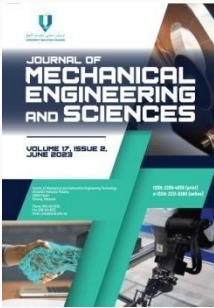
JOURNAL OF MECHANICAL ENGINEERING AND SCIENCES (JMES)