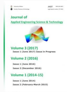
JOURNAL OF APPLIED ENGINEERING SCIENCE & TECHNOLOGY (JAEST)